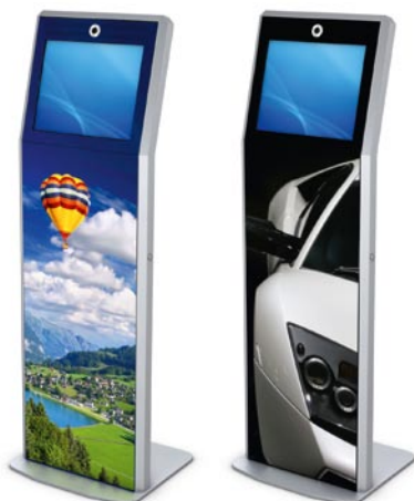
Individual design through the use of stick-on graphics

Some examples of possible uses of the ASTALON model include providing general information, for wayfinding, as a POI, as a POS, for time recording, for providing employee information, as a virtual porter, or for trade shows and multimedia presentations.