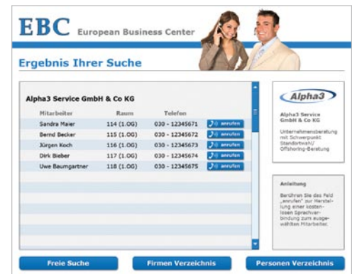
Information about companies and employees