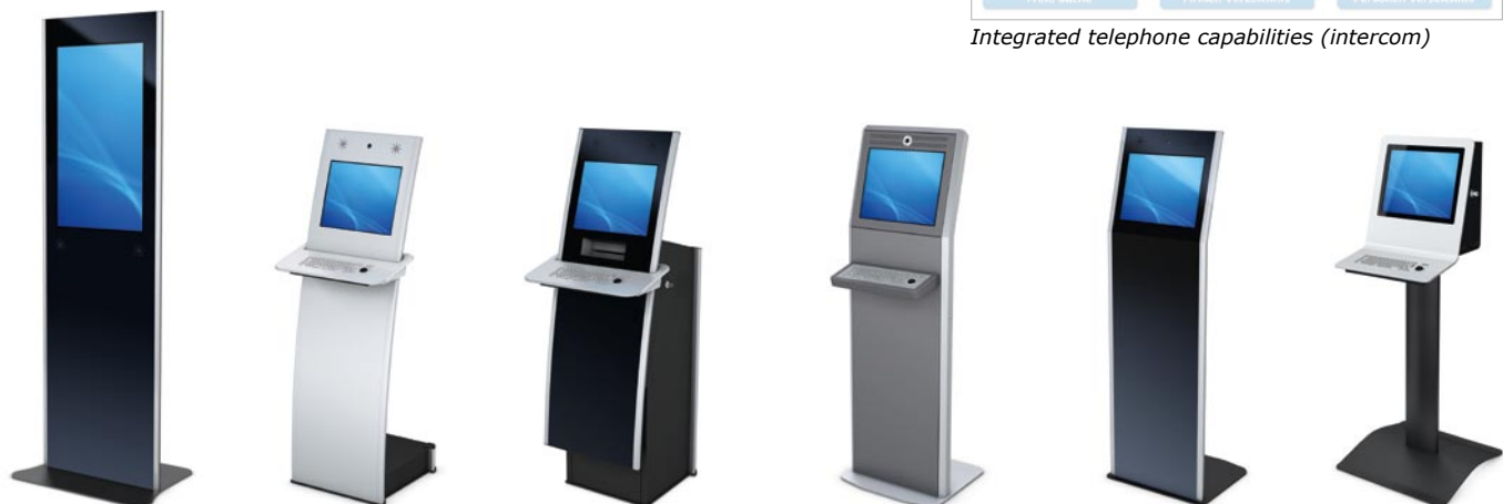
Diverse hardware options available for the virtual porter (from left to right: PHEX, ISIS, HERA, ASTALON, VANA and HATHOR)