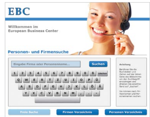
Person and company search

A service interface enables the self-administration of content.